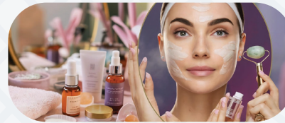
Beauty & Skincare