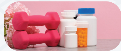
Health & Fitness Products