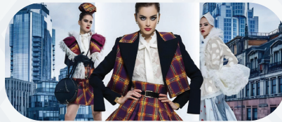
Fashion & Apparel

Our services support a wide range of industries with dependable, high-quality products. We focus on efficiency, reliability, and customer satisfaction.