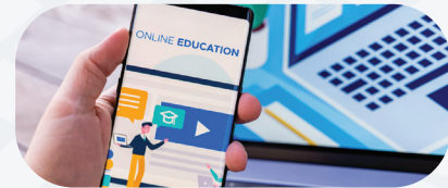
Online Courses / Digital Products